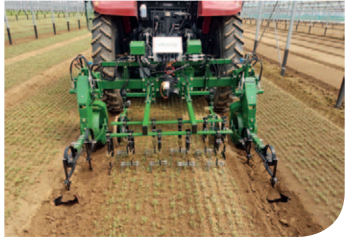
Ultra precise mini for roller seeder established crops.