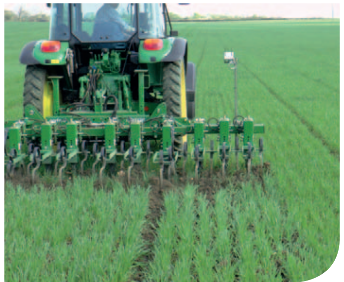
The Robocrop camera views numerous crop rows over an area of approximately 1.5mtr.sq.