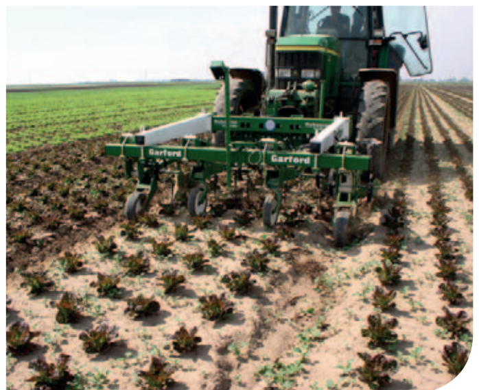
The custom colour feature enables operation on all crop colours