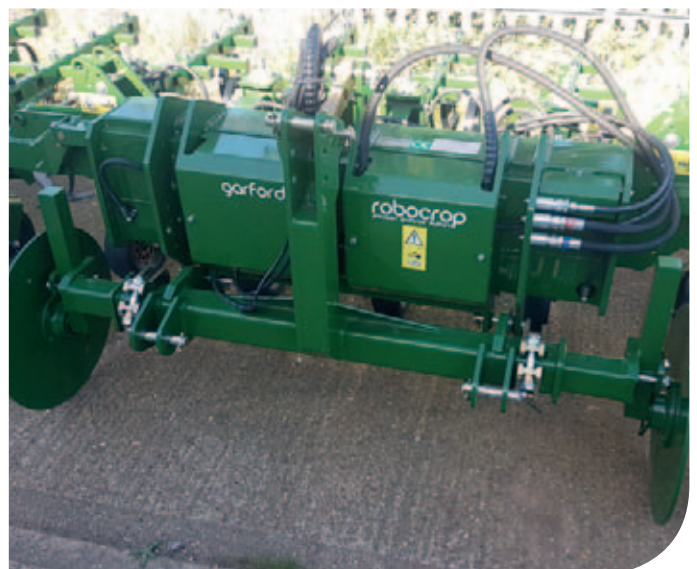
The compact hydraulic sideshift mechanism is available in Standard, Heavy Duty and Extra Heavy Duty for mounted hoes up to 18mtr

High Accuracy! High Speed! Reduced Operator fatigue!