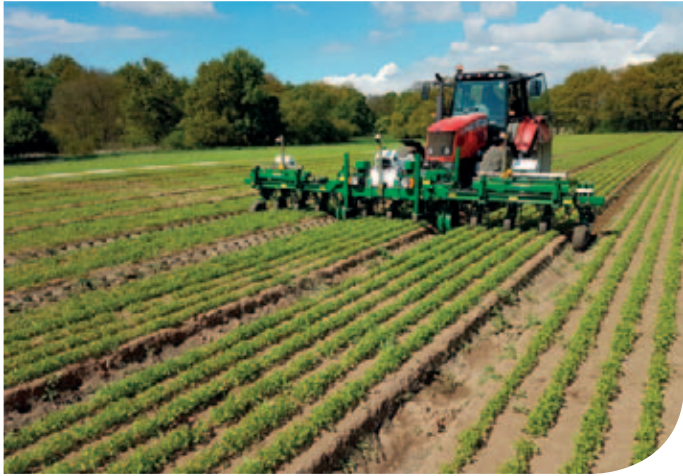
Multi camera, multi section types.