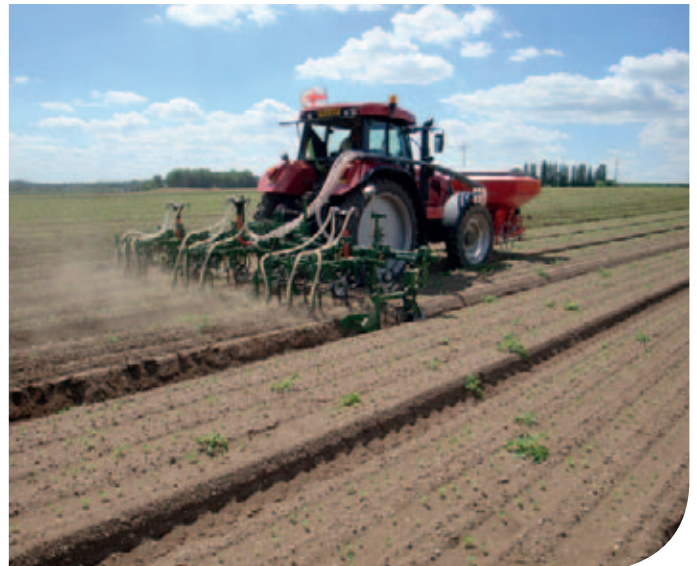
Fertiliser and agrochemical application equipment can be incorporated

High Accuracy! High Speed! Reduced Operator fatigue!