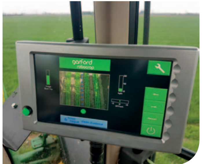
Simple and robust Robocrop console with touch screen controls