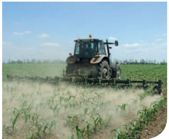
Robocrop enables large rear mounted cultivator to operate swiftly and accurately with reduced operator fatigue.